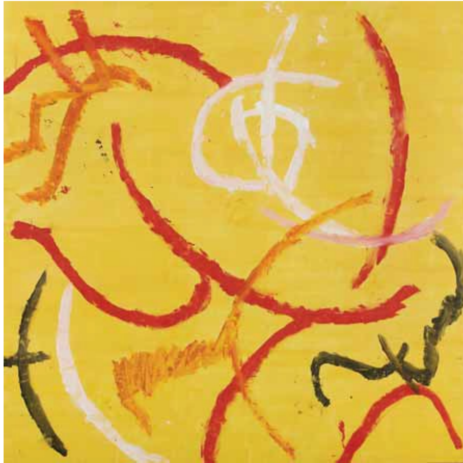
Ice Desert IX | 2010 | 100 x 100 cm (framed: 105 x 105 cm) | oil on canvas

The piece was painted in Antarctica, as the artist was faced with the most treacherous weather conditions on earth. Harshness of the climate is symbolised by abstract shapes which resemble slashes on the brightly painted background.