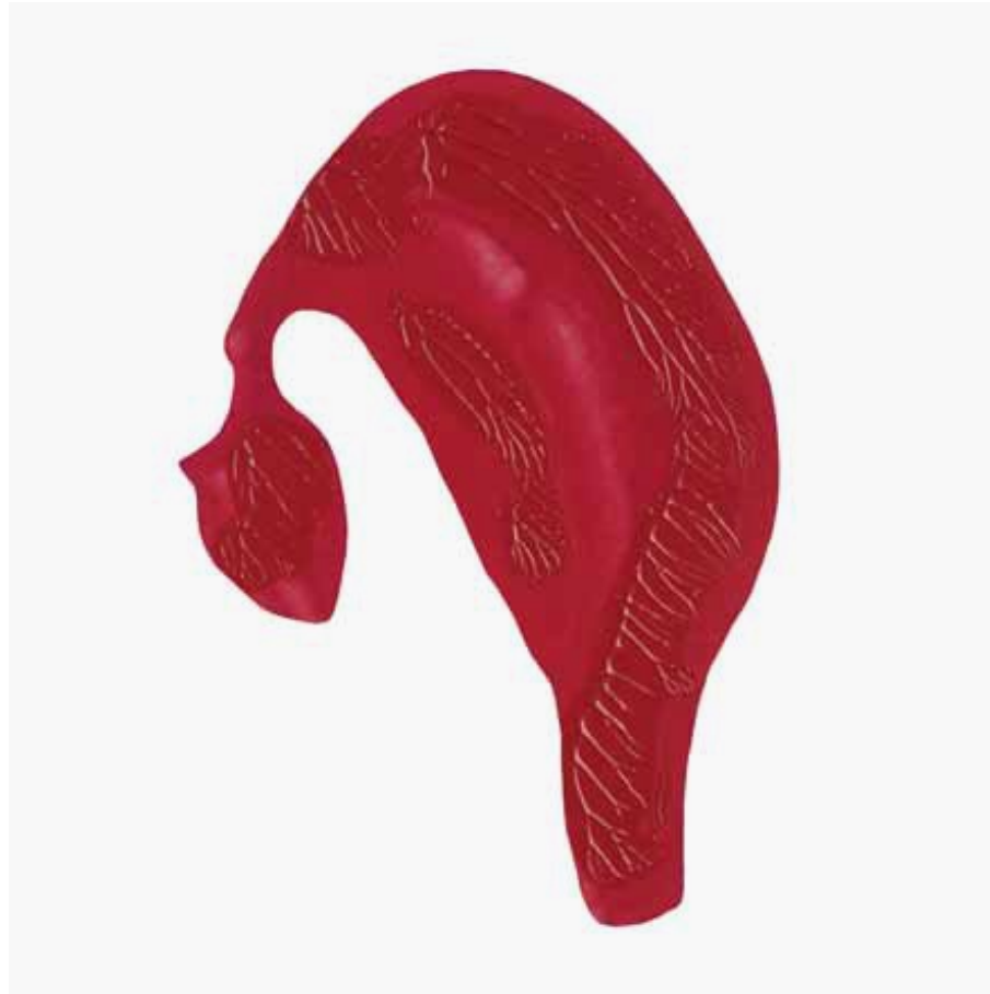
Aquinnah V | 2013 | 81 x 81 cm | flatbed inkjet print on mirror

Created after the global success of the artist's monumental sculptures, the AQUINNAH series represents the beginning of Azam's mature phase, which combines the elements of the three key traditional techniques - painting, sculpture and printmaking.