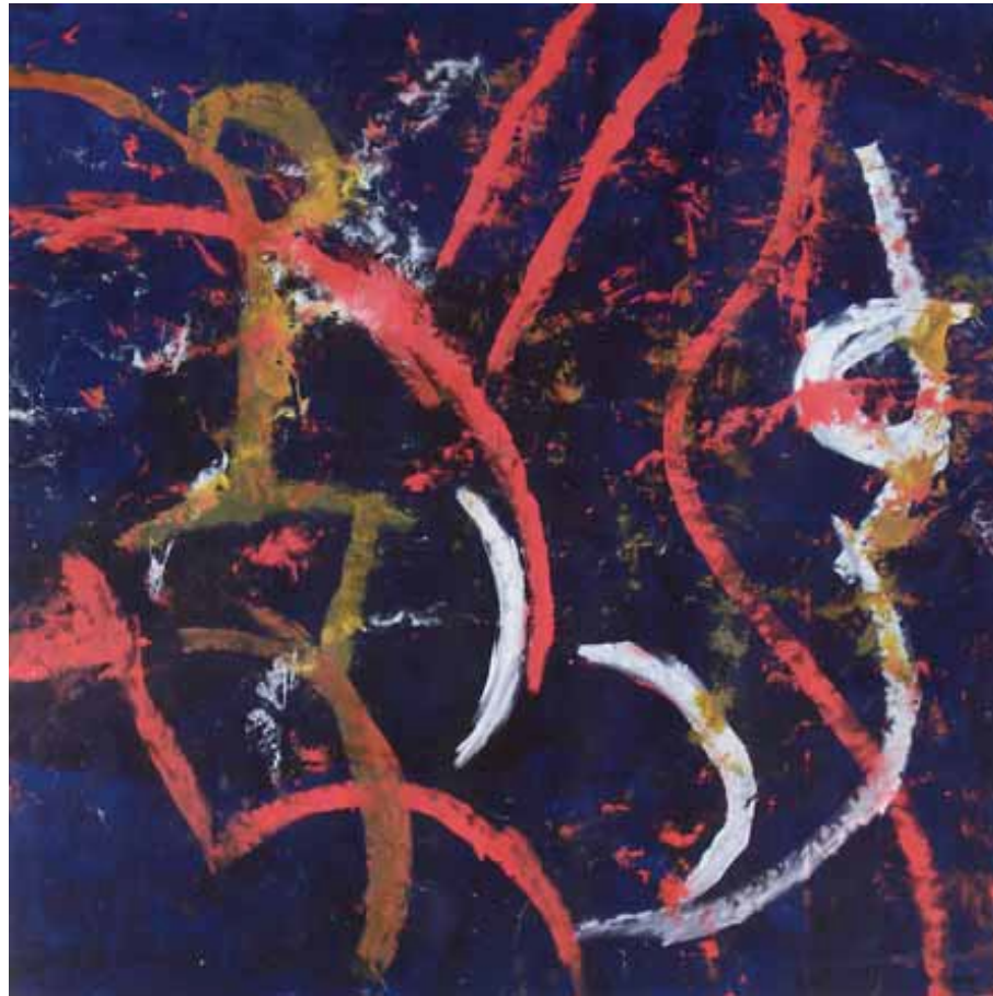
Ice Desert III | 2010 | 100 x 100 cm (framed: 105 x 105 cm) | oil on canvas

The artist's recognisable blue background refers to the skylines of Antarctica. The ice continent is almost void of life, so the sky is often the only source of colour. Linear brush strokes symbolise the artist's creative intervention in a motionless environment.