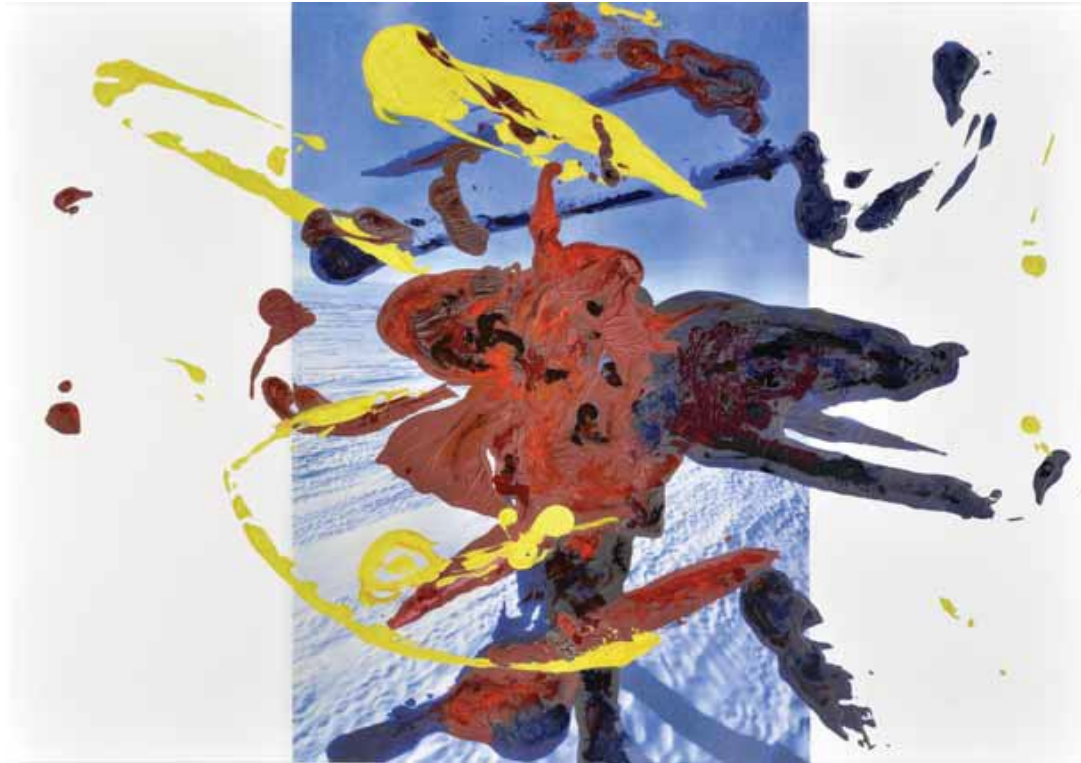
Antarctica Iterations I.XI | 2010 | 85 x 120 cm | oil on canvas

Painted upon return from an expedition to Antarctica. Palette is reduced to primary colours, laid over images of the continent's ice desert. Stark contrast between the two represents artistic intervention in the blank landscape resembling a canvas.