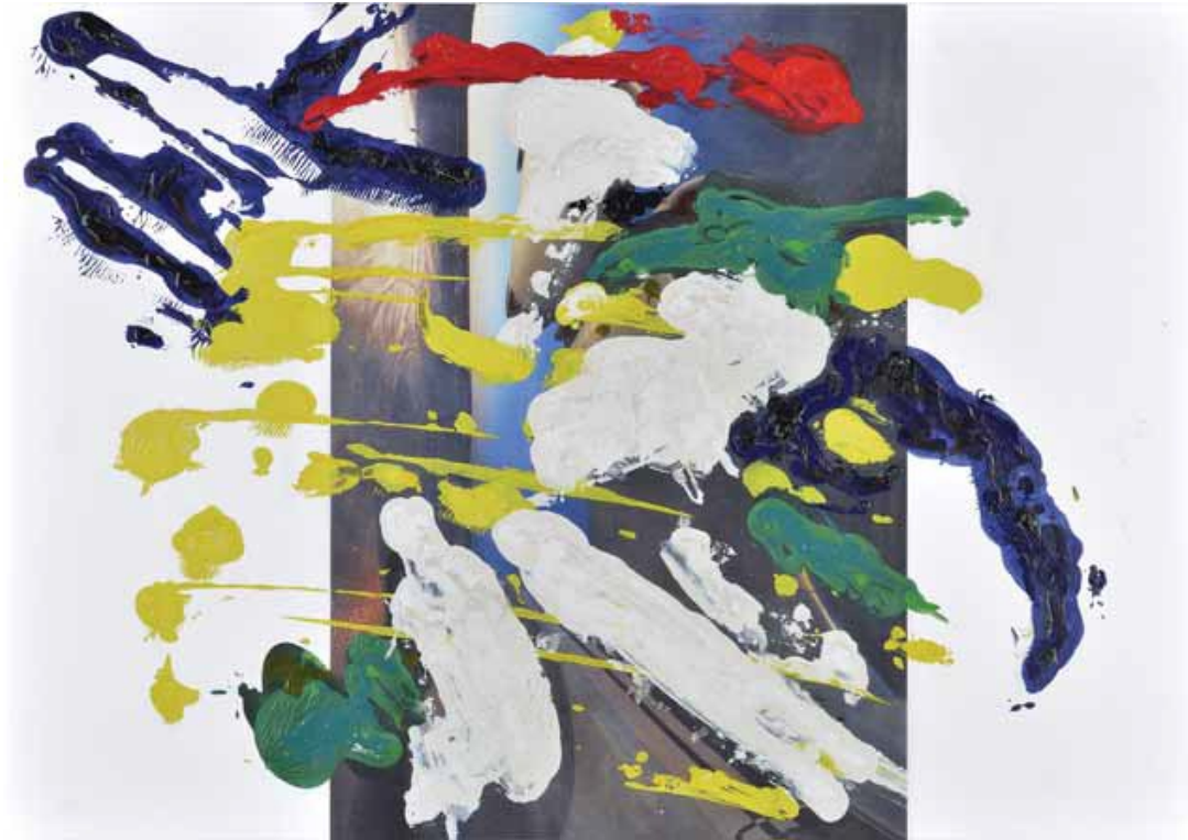
Antarctica Iterations VIX | 2010 | 85 x 120 cm | oil on canvas

The series of works influenced by the ice landscapes marks the artist's transformative journey – from the busy life in global capitals to the contemplative creative process taking place in his studio.