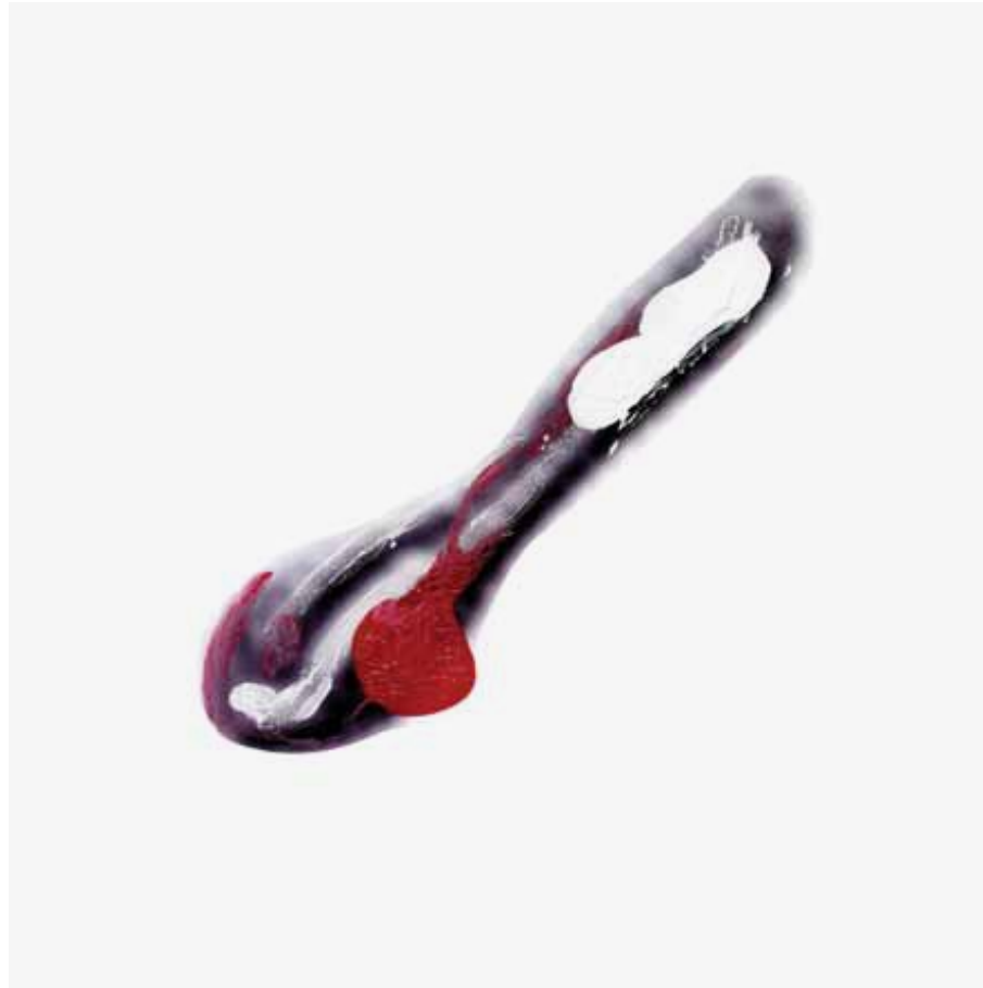
Aquinnah I | 2013 | 81 x 81 cm | flatbed inkjet print on mirror

Azam developed a unique printing technique with abstract shapes floating on the flat mirrored surface. When confronted with pieces, spectators are seeing themselves as an integral part of the artwork.