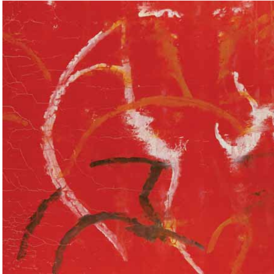
Ice Desert II | 2010 | 100 x 100 cm (framed: 105 x 105 cm) | oil on canvas

The red painting created in Antarctica represents a red flag, symbol of an emergency in a fast changing climate of the ice continent. It is also a mark of the artist's confrontation with the elements, which saw him battle the winds, sub-zero temperature and blizzards to complete the artwork.