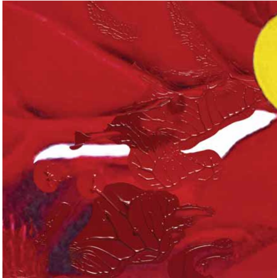
Aquinnah IV | 2013 | 81 x 81 cm | flatbed inkjet print on mirror

In his most personal and reflective series, Azam plays with two-dimensionality of painting. Although flat, these mirror pieces create a sense of space behind the intermittent layers of paint.