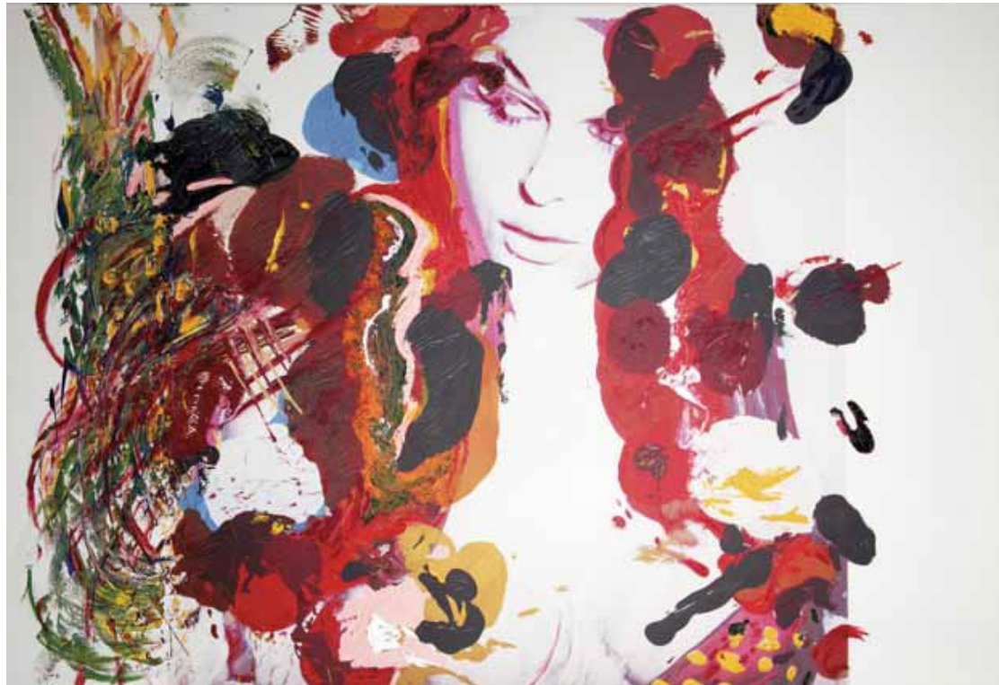
Poppy | 2010 | 185 x 285 cm | oil on canvas

Displayed at the Victoria & Albert Museum in London to commemorate the 40 th anniversary of The Sun Newspaper (News International Group's) iconic Page 3 models